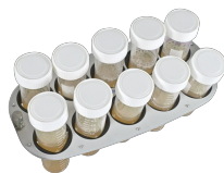
PRS-10 BS-010117-IK platform

5 tubes 20-30 mm diameter (50 ml tubes) and 12 tubes 10-16 mm diameter (1.5-15 ml tubes).