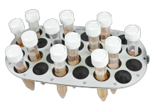
PRS-26 BS-010117-GK platform

Can accommodate 26 tubes 10-16 mm diameter (1.5-15 ml).