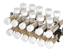
PRSC-22 BS-010117-LK platform

10 tubes 20-30 mm diameter (up to 50 ml tubes).