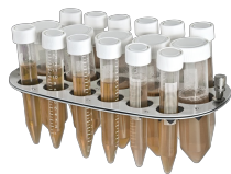
PRS-5/12 BS-010117-HK platform

Can accommodate 26 tubes 10-16 mm diameter (1.5-15 ml).