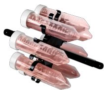
M-8/50 BS-010117-PK platform

10 tubes 25-30 mm diameter (50 ml tubes).