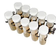
PRSC-10 BS-010117-LK platform

Can accommodate 22 tubes 16 mm diameter (15 ml).