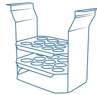
TR-44/11 BS-010406-JK rack

Test tube rack for \varnothing 10 to \varnothing 13mm tubes, capacity 30 tubes