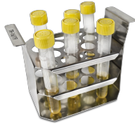
TR-16/19 BS-010406-FK rack

Test tube rack for \varnothing 30mm tubes, capacity 5 tubes