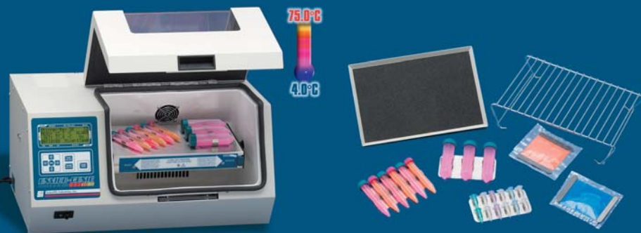
Accessories Supplied with Unit