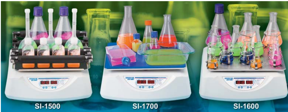
New and Improved Design with "Whisper Quiet™ Technology"