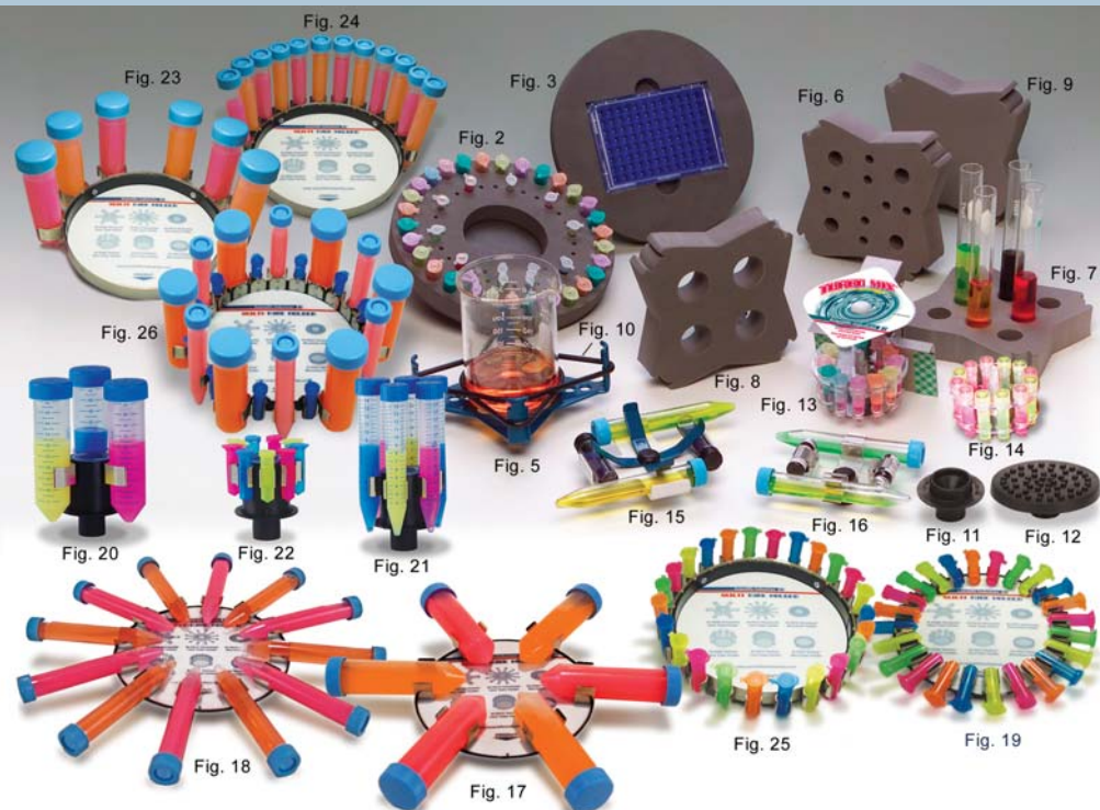
Fig. 1 Model H301 Multiple Sample Starter Set