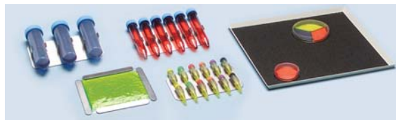
Accessories Supplied with Unit