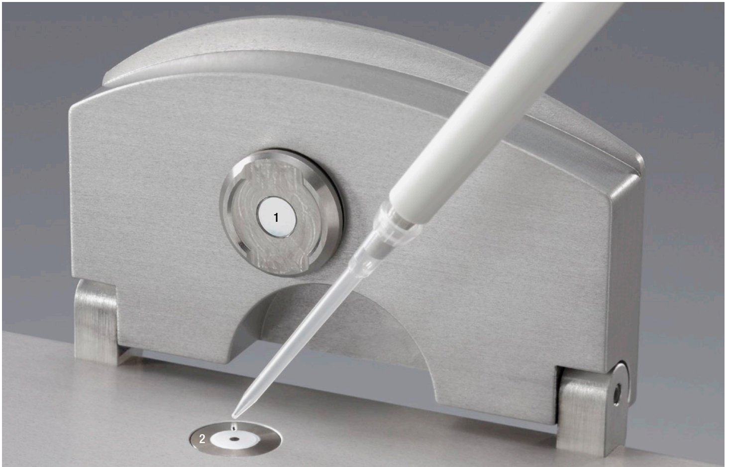
1 Optical-grade mirror behind sapphire glass 2 Permanent hydrophobic coating for easy sample placement