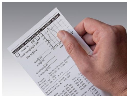
Comprehensive report, convenient printout format.