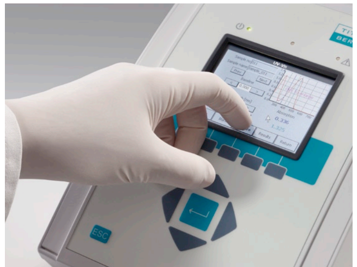
Onboard computer, color touchscreen