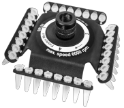
SR-32 BS-010205-FK rotor

Rotor for 2 x 8-section 0,2 ml microtube strips