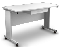
T-4L BS-040107-BK Table

New modular design of laboratory furniture provides flexibility and ease of use.